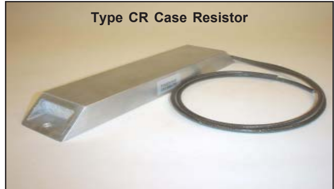
Type CR Case Resistor

CUSTOM LEADS: The standard lead length can be varied and the ends can be furnished with ring or fork terminals and male or female disconnects.