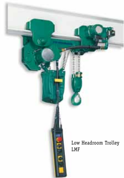
Low Headroom Trolley LMF